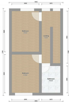
St Stephens First Floor